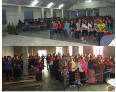
(Top) Bible school chapel (Bottom) Revival service