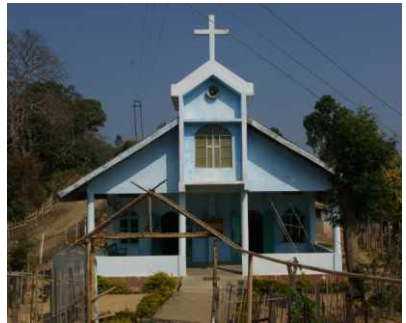
Mountain church revival