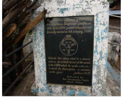
Stopping of head hunting agreement