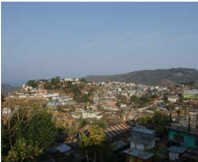
City roof top view