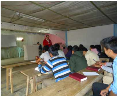
Discipleship Equipping School students