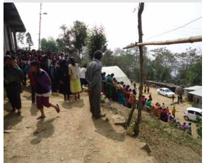
Heading home from church