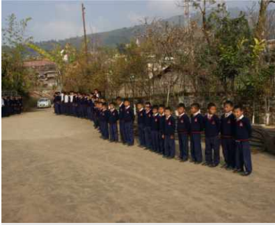
Children welcoming us