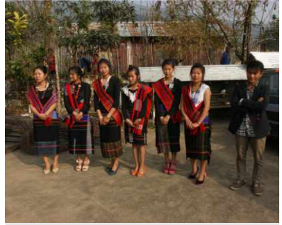
Naga students in traditional dress