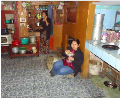
Past and present kitchen