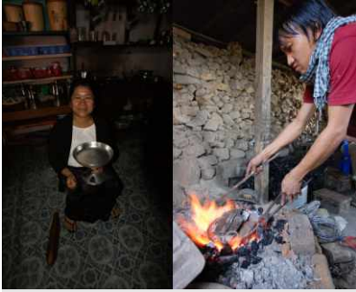
(Left) Caterpillar swelling (Right) Blacksmith shop