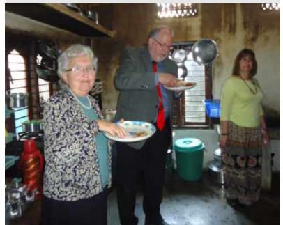
Eating with one's hands