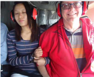
Pastor's daughter-in-law has a fear of flying