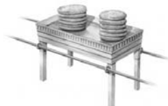
TABLE OF SHOWBREAD