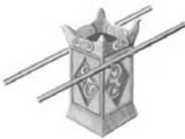
ALTAR OF INCENSE