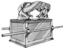
The Ark of the Covenant with the Mercy Seat

Drawing of the Tabernacle © 2005 A. vander Nat